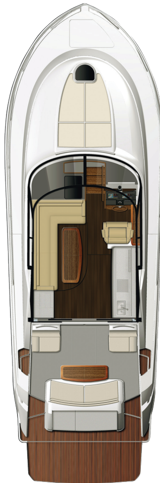
Standard Upper Salon, Galley, & Cockpit Floor Plan